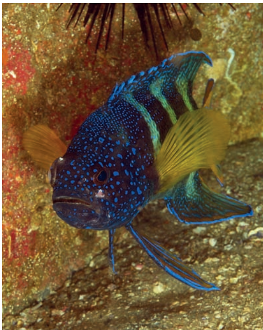
above: It's not uncommon to see rare temperate species like the eastern blue devilfish ( Paraplesiops bleekeri )