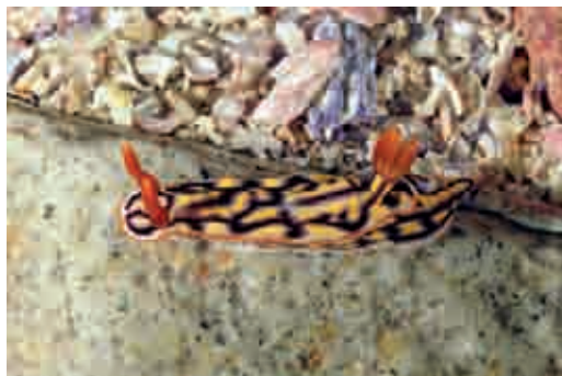
above: Macro enthusiasts will enjoy nudibranch encounters like this rare tiled hypselodoris ( Hypselodoris jacksoni )

Green Island is located just north of Smokey Cape lighthouse and only a stone's throw from shore. This site is a popular second dive, especially if there's too much current at Fish Rock. The average depth for the site is 14m and the habitat is rocky reef sloping onto sand. This site can be thick with schools of fish like bream, drummers, and tailors; and once you get through the schools of fish you will see