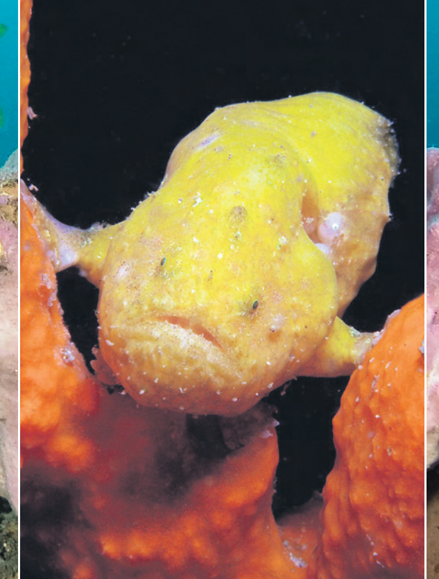
RESIDENTS: Marine animals in the Port Stephens - Great Lakes Marine Park, clockwise from left - White's seahorse, at Seahorse Gardens; donut nembrotha nudibranch at Cabbage Tree Island; grey nurse shark at Broughton Island; pineapple fish at Fly Point; Nelson Bay angler fish at Pipeline.